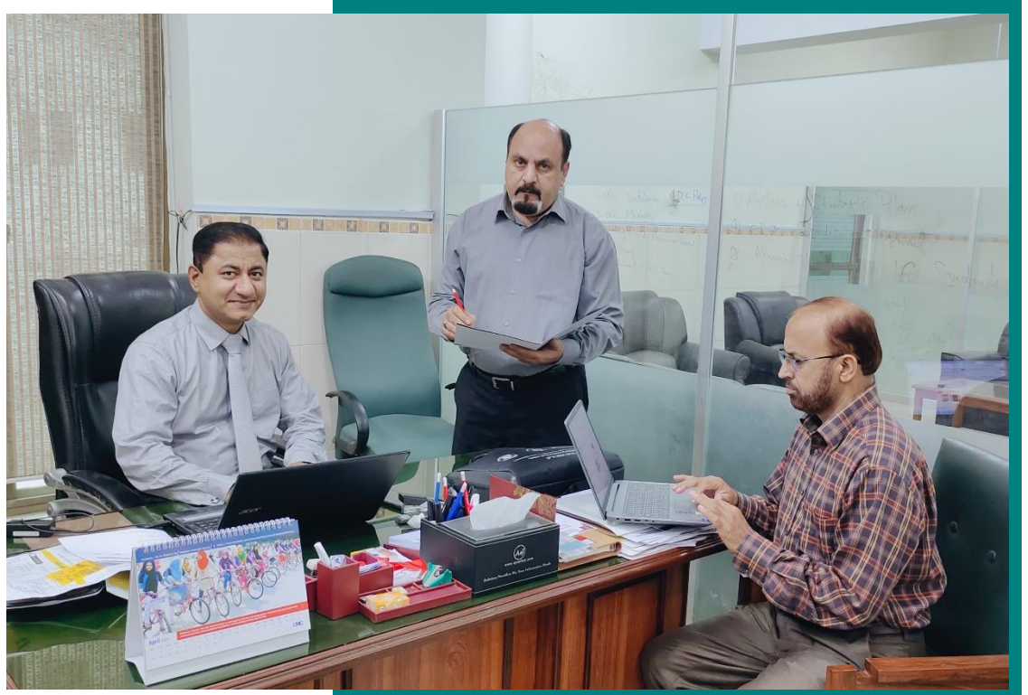
Authors of the draft

While ethical guidelines are not administrative rules and the conscience of researchers may be the best guide for ensuring that ethics are followed in research and for resolving ethical dilemmas. However, conduct of research cannot be completely left to the discretion of individual researchers. Hence before conducting research in social sciences at University of Sargodha, the approval from ethical review board is necessary. For ethical approvals or any complaint please contact with ORIC-UOS or directly apply on oric.erb@uos.edu.pk