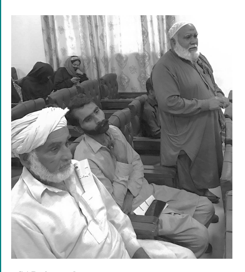
Part C Ethical Policy for Social Sciences

Ethics is concerned with the conduct of human beings.